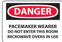
PS 7 x 10 D409P PS 10 x 14 D409PB RP 7 x 10 D409R RP 10 x 14 D409RB