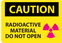
PS 10 x 14 C590PB RP 10 x 14 C590RB AL 10 x 14 C590AB