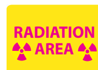
PS 7 x 10 R21P RP 7 x 10 R21R