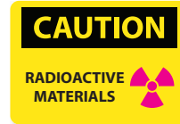
PS 10 x 14 C592PB RP 10 x 14 C592RB AL 10 x 14 C592AB