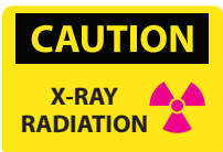
PS 10 x 14 C661PB RP 10 x 14 C661RB AL 10 x 14 C661AB