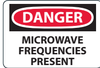
PS 7 x 10 D454P PS 10 x 14 D454PB RP 7 x 10 D454R RP 10 x 14 D454RB