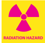
PS 7 x 7 S68P RP 7 x 7 S68R