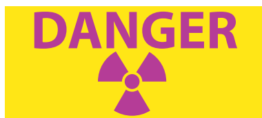
3 1/2 x 8 RI2