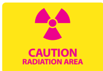
PS 10 x 14 R23PB RP 10 x 14 R23RB AL 10 x 14 R23AB