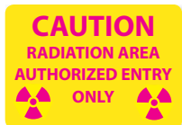
PS 7 x 10 R12P RP 7 x 10 R12R AL 10 x 14 R12AB