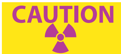
3 1/2 x 8 RI3