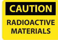
PS 10 x 14 C591PB RP 10 x 14 C591RB AL 10 x 14 C591AB