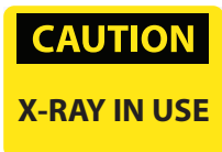
PS 10 x 14 C660PB RP 10 x 14 C660RB AL 10 x 14 C660AB