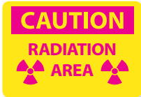
PS 10 x 14 R27PB RP 10 x 14 R27RB AL 10 x 14 R27AB