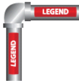
Next to changes in direction