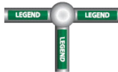
Next to valves and flanges